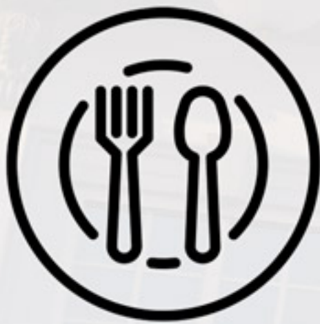
Coffee & Restaurant